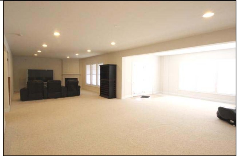
Large Rec Room