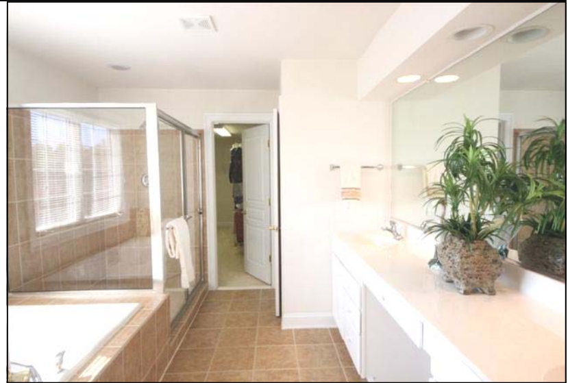
Master Bedroom suite features Trey ceiling, Large Master Bath with Walk-in Closet