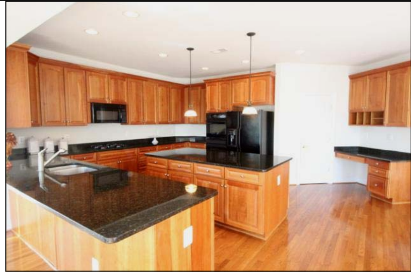
Large, Open Kitchen with Granite Counters and Island