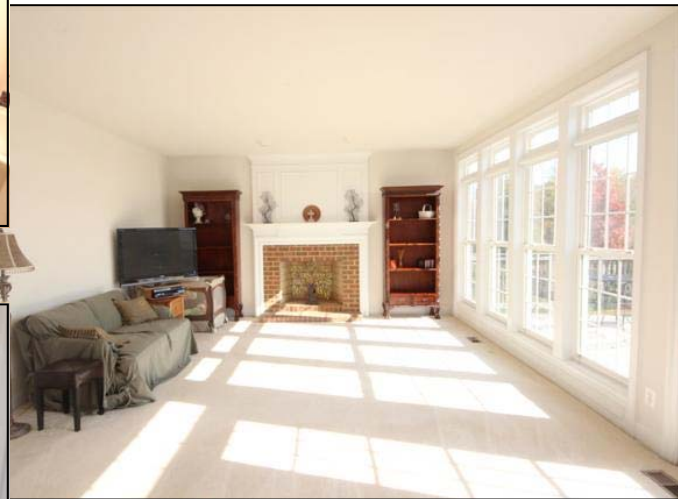
Large Breakfast Room with a Wall of Windows, Family Room off Kitchen, plus 2 Half Baths