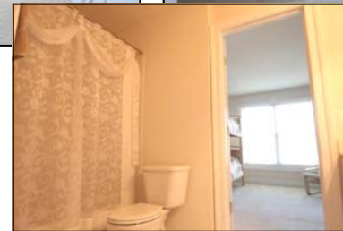
Other Bedrooms and Bathrooms