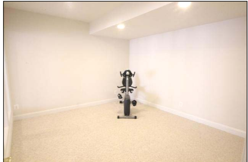
Separate Exercise Room