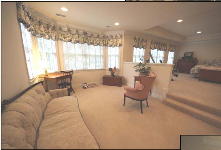
Master Bedroom sitting area