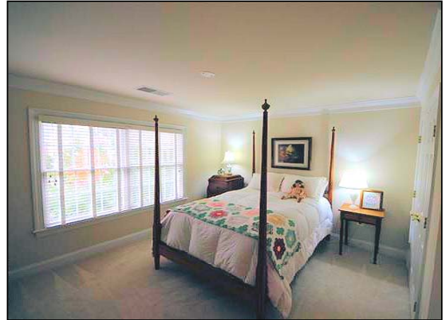
Upper Level Bedrooms