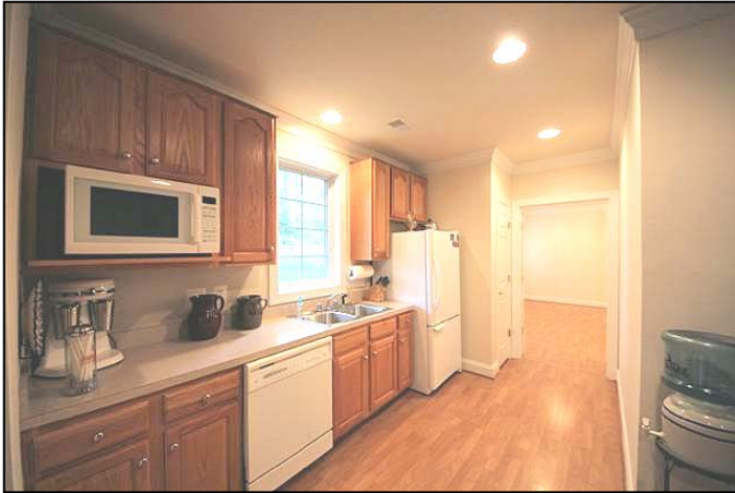
Ground Level Kitchen