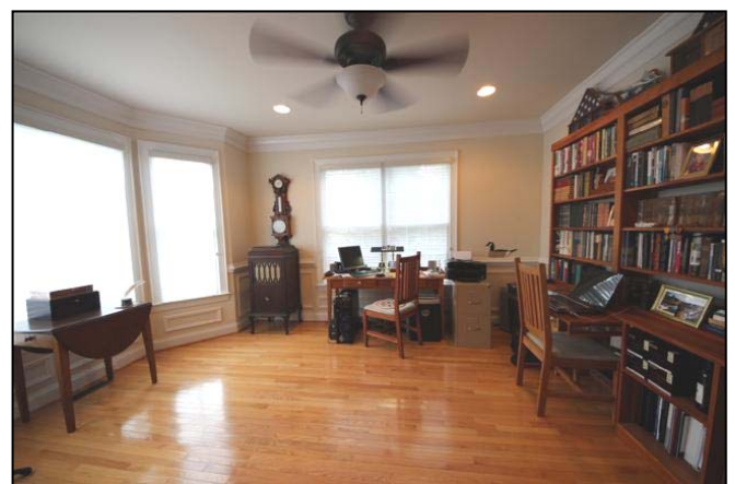
Main Level Library