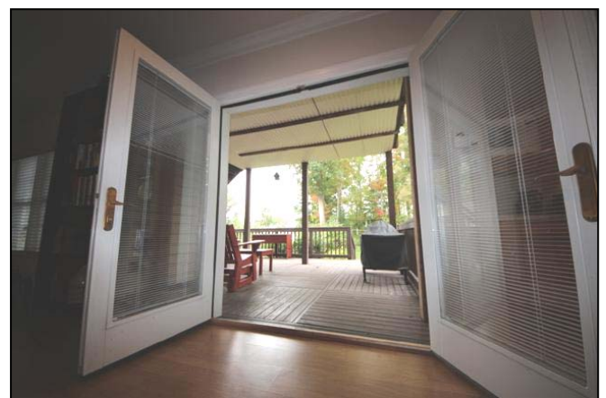
Ground Level French Doors leading to Patio