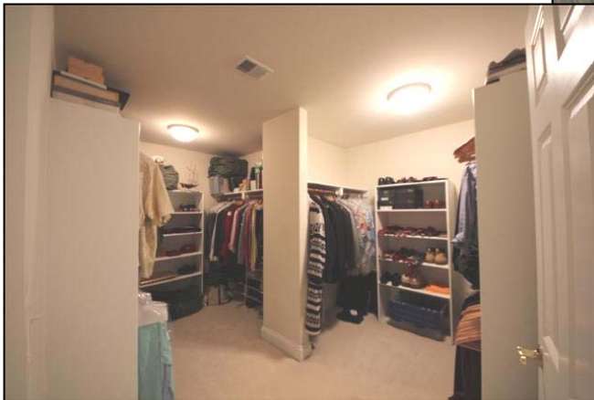
Large Walk-in Closet