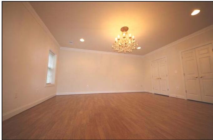
Ground Level Bedroom