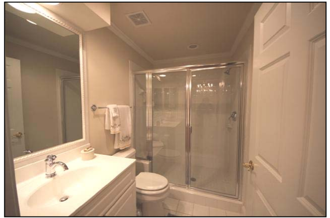
Ground Level Full Bath