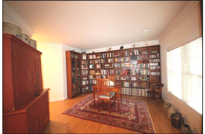
Recreation Room/Reading Room