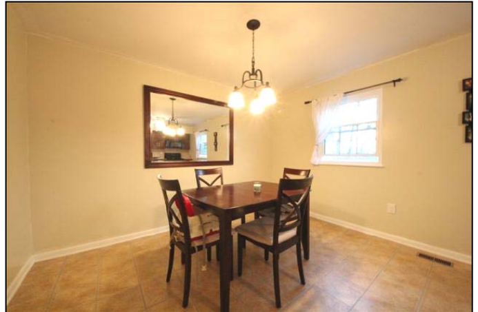
Eat in Kitchen