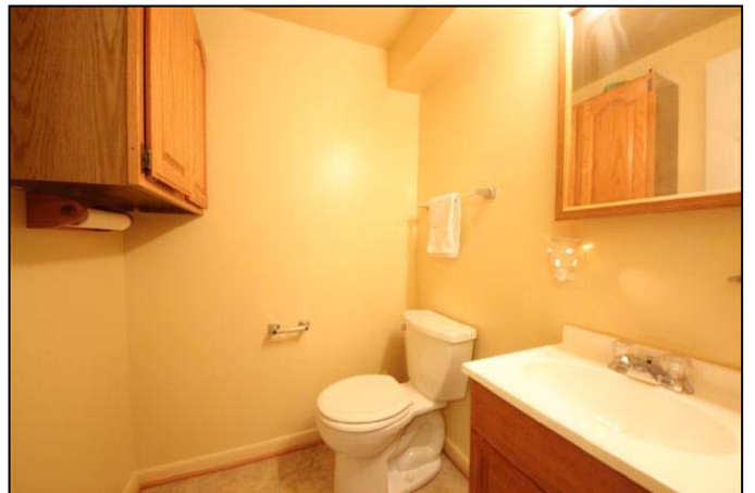
Lower Level Bath