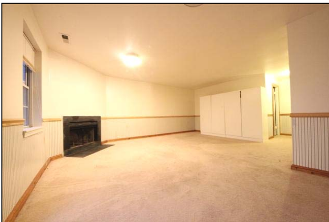
Rec Room other view