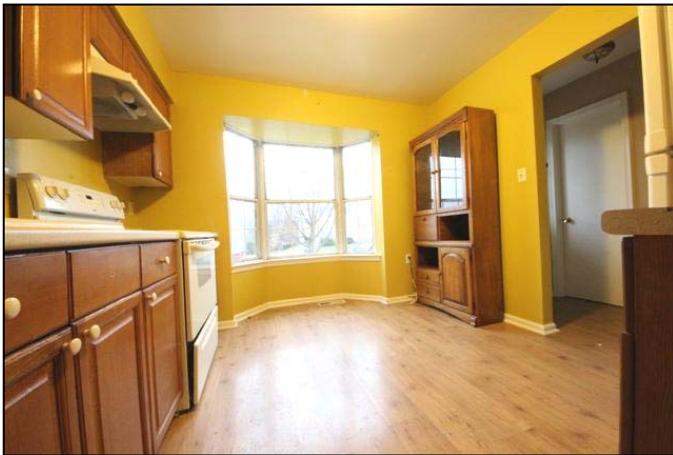
Eat-in Kitchen area