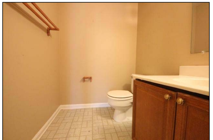
Lower Level Bath